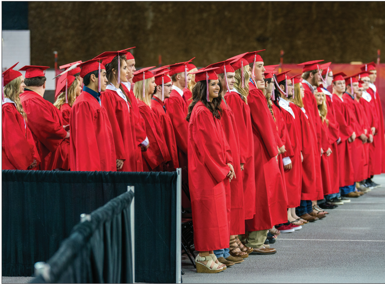
The 2015 graduating class of Vermillion High School received their diplomas on Saturday during commencement ceremonies held at the Dakota Dome.