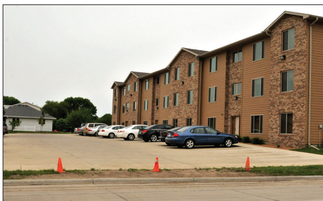
During a public hearing held Monday by the Vermillion City Council, a compromise was reached to allow a right-in and right-out only driveway at this apartment complex located in Vermillion.