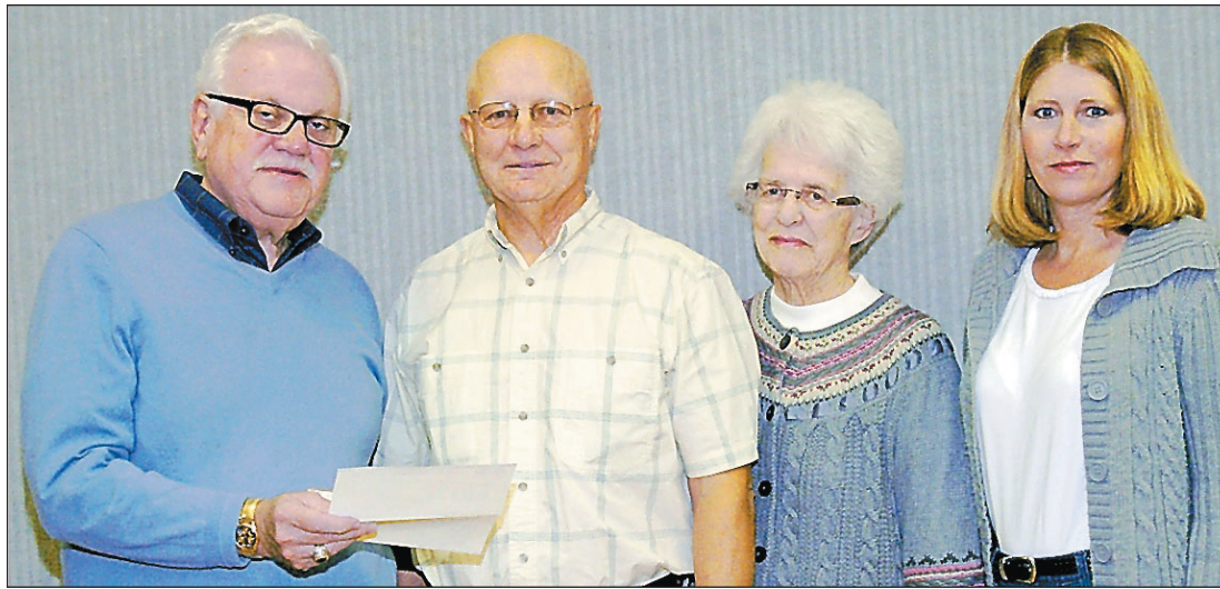
VACF gives funds to W.H. Over Museum, Center for Families and Children

Does your business or organization have an event you would like included in the Community Calendar? If you do please call the Vermillion Area Chamber of Commerce and Development Company at 605-624-5571 or e-mail vcdc@vermillionchamber.com