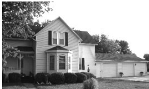
204 Brown St., Gayville Reduced - $136,000

4-Bedroom 2-full bath. Home Warranty (605)660-7537 www.yankton.net/204brown/