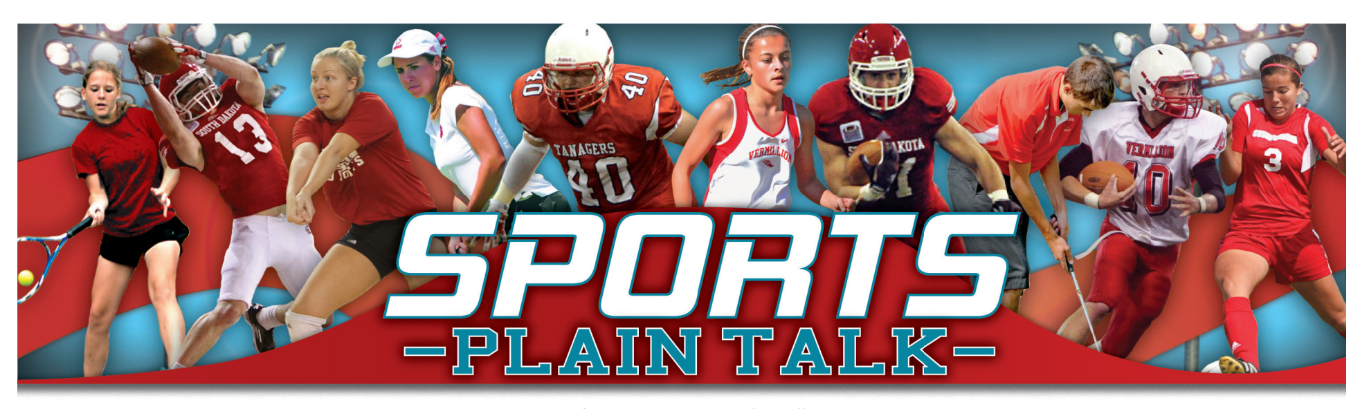
November 28, 2014 www.plaintalk.net