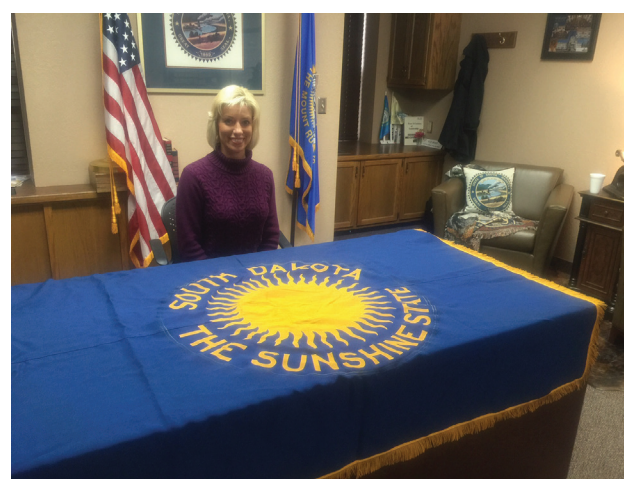
Secretary of State Shantel Krebs with returned original flag

Official Pledge of the State Flag: “I pledge loyalty and support to the flag and the state of South Dakota, land of sunshine, land of infinite variety.”