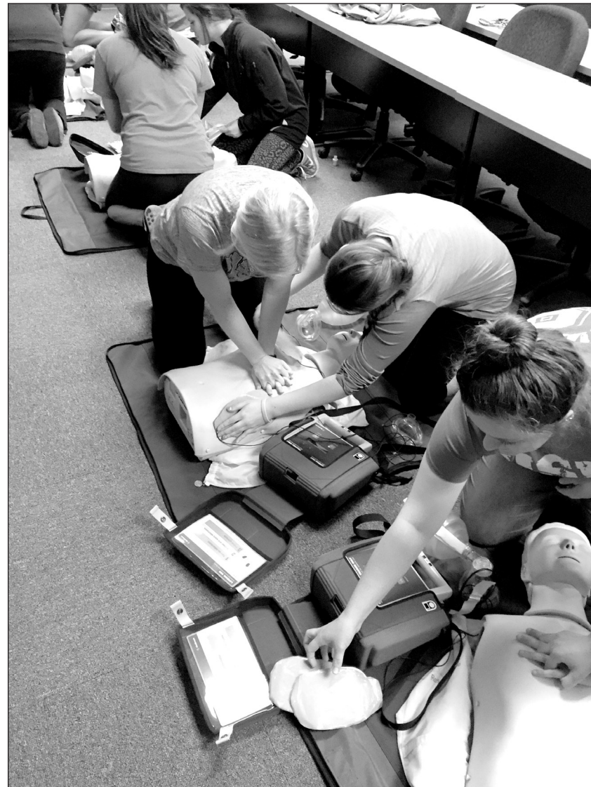
CPR classes are offered monthly at the Vermillion Fire/EMS. Pictured are students from a recent class.

"Another thing that changed is it went from compressing 2 inches to 2.5," Wetherington said. "They put a top cap on it because one minor study showed that if people push too deep then they could cause injury to the