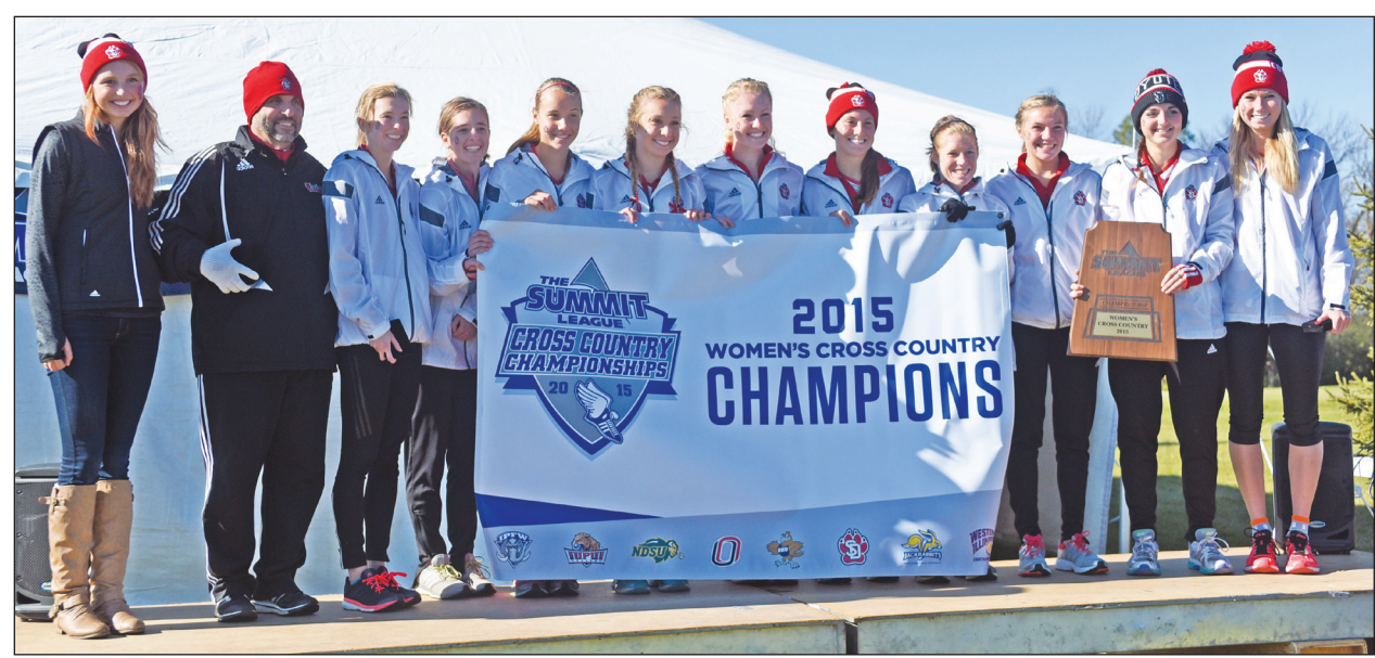
The South Dakota women's cross country team takes the awards stand after receiving the championship trophy for winning the Summit League Cross Country Championships on Saturday in Brookings. It was the Covotes' second straight league title.