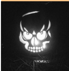
2008 Scariest Pumpkin Winner

Giant pumpkins carved by local artists (cash prizes) • Free beverages Face painting • Kids games • Food Halloween music • Free hay rides Calf-roping dummy • Pumpkin bake-off Pet costume contest Scarecrow contest & More