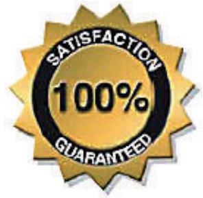
Serving Southeast SD for 43 years