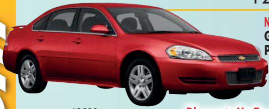
#2538 4 AT THIS DISCOUNT