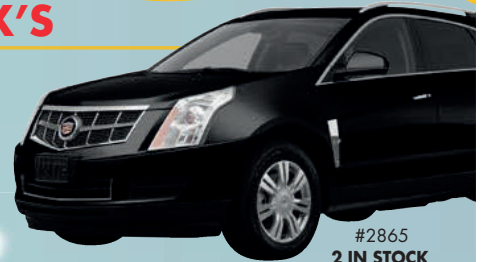
#2865 2 IN STOCK 1 AT THIS PRICE!