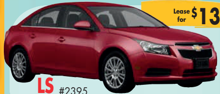
LS #2395 4 IN STOCK, Automatic