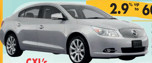
CXL's #2687 2 AT THIS DISCOUNT