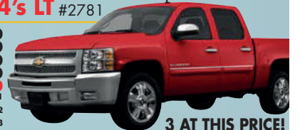
3 AT THIS PRICE!

Pricing As Low As $26,250* up to $12,500 OFF MSRP