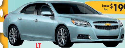
LT #2919 10 IN STOCK