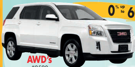
AWD's #2590 4 AT THIS DISCOUNT