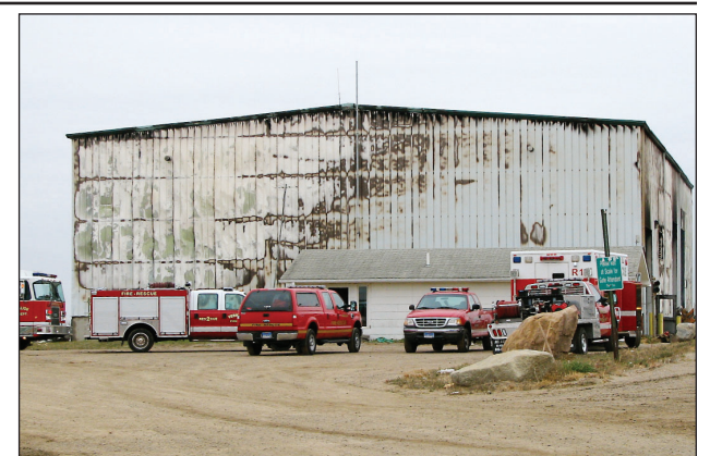
The baler building at the Vermillion Landfill stands charred after an early-morning fire Monday. Four fire departments cooperated in extinguishing the blaze.