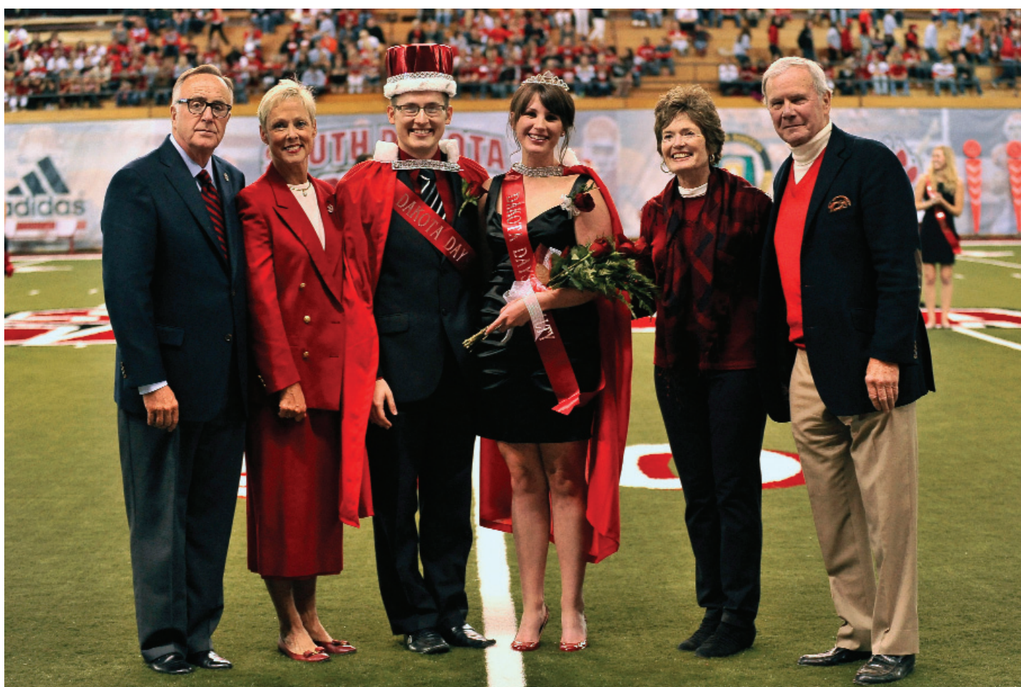
There have been 100 years of Dakota Days ... and so far it's been quite grand.

He also watched the campus survive plenty of ups and downs the nation had to