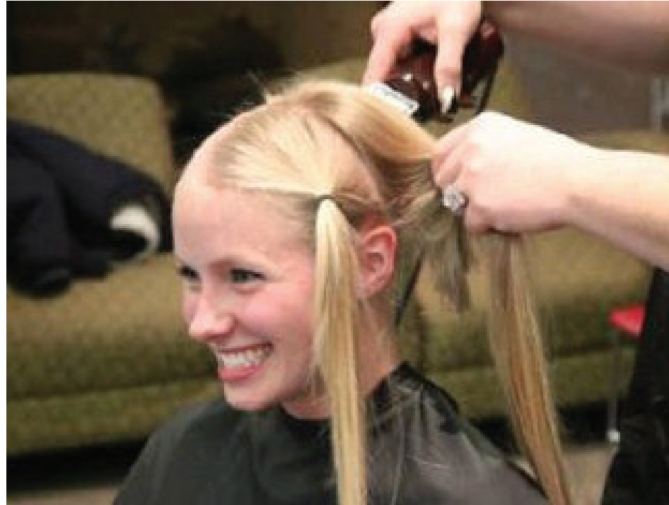
Shave for the brave this 'Shavetober' as Halloween brings out the best of the scary.