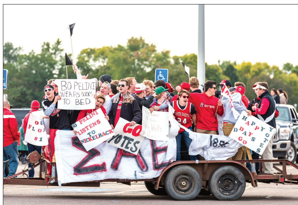
USD Students went all in on Saturday celebrating Dakota Days. From crazy costumes to crazy signs, popular topics were Bo Pelini slams and school spirit.