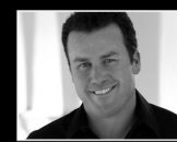
Rodney Carrington December 3