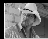
Trace Adkins October 14

PEPPERMILL CONCERT HALL Check wendoverfun.com for ticket availability