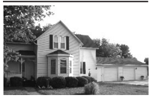
204 Brown St., Gayville $139,900

4-Bedroom 2-full bath. Home Warranty (605)660-7537 www.yankton.net/204brown/