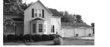
Brown St., Gayville $139,900

4-Bedroom 2-full bath. Home Warranty (605)660-7537 www.yankton.net/204brown/