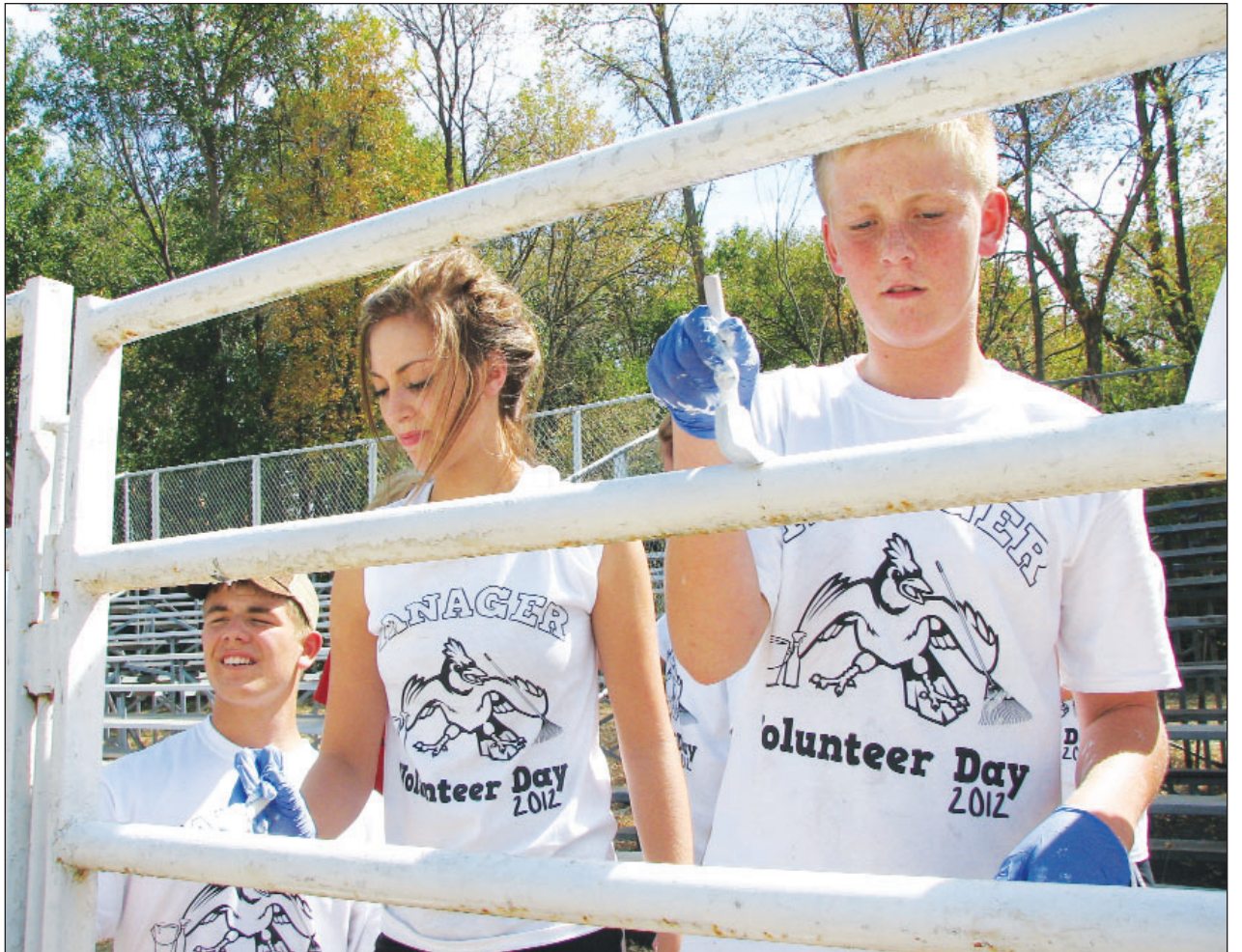
Vermillion High School students put a new coat of paint on the fence at the Clay County Rodeo Grounds as part of Tuesday's fifth annual Tanager Volunteer Day.

"It's not always fun to weed and paint, but you're