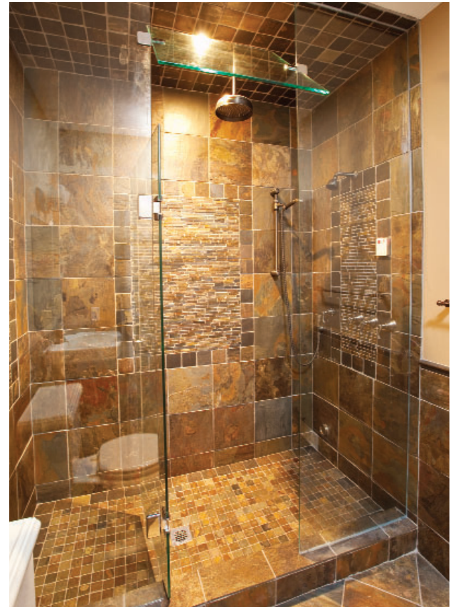
A frameless shower can take up less space in a small bathroom.