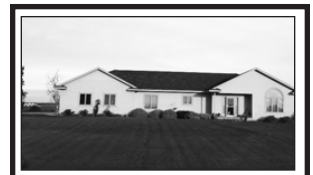
31085 451st Ave. Gayville, SD $265,000