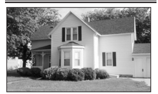
204 Brown St • Gayville $139,900

Beautiful 2 story home 4-bedrooms, formal dining, large kitchen, main floor laundry and oversized garage. Call Brad Dykes (605)660-1414. Shore to Shore Realty, LLC.