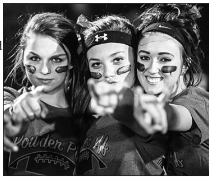
Aiming for you!

It's not an event sanctioned by Vermillion Public Schools, but it isn't exactly a secret either. The sports complex along Cherry Street was the venue, and the energy was high.