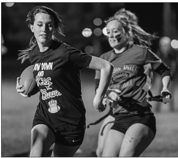
Running hard for Glory.