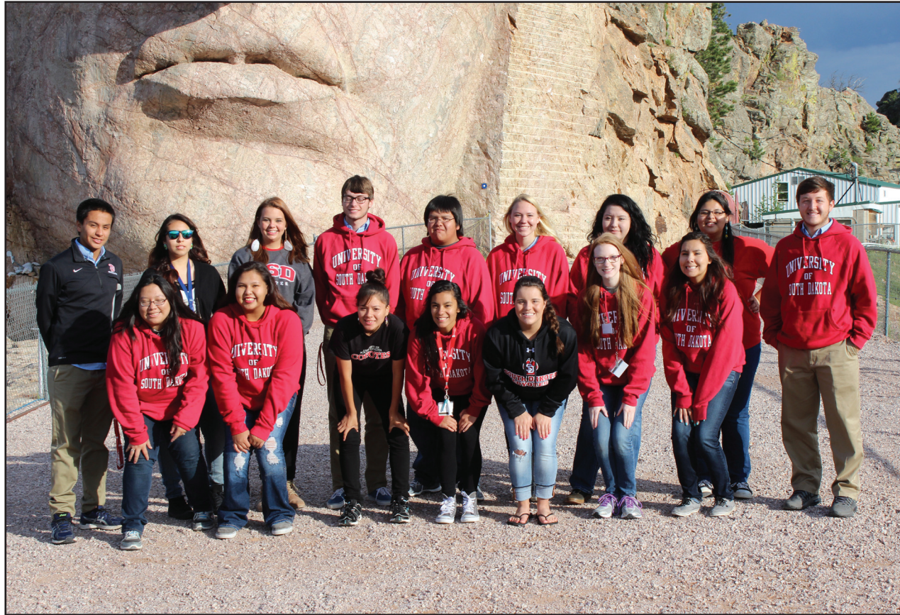
VERMILLION, S.D. — Half of the 32 students who attended the 2015 Indian University of North America at Crazy Horse Memorial in the Black Hills are studying at or plan to attend the University of South Dakota.

The partnership between USD and the Crazy Horse Memorial Foundation offers an eight-week summer program at the memorial in which students, most of them from American Indian tribes from around the country, enroll in college courses like English, math and speech that are taught by USD instructors.